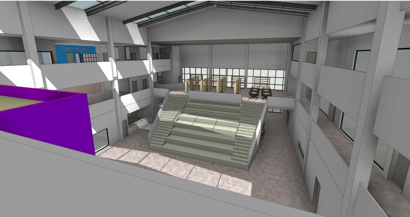
Architects impression of the internal area of Burnley High School