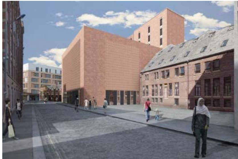
Architect Image of One Cutting Room Square from Jersey Street