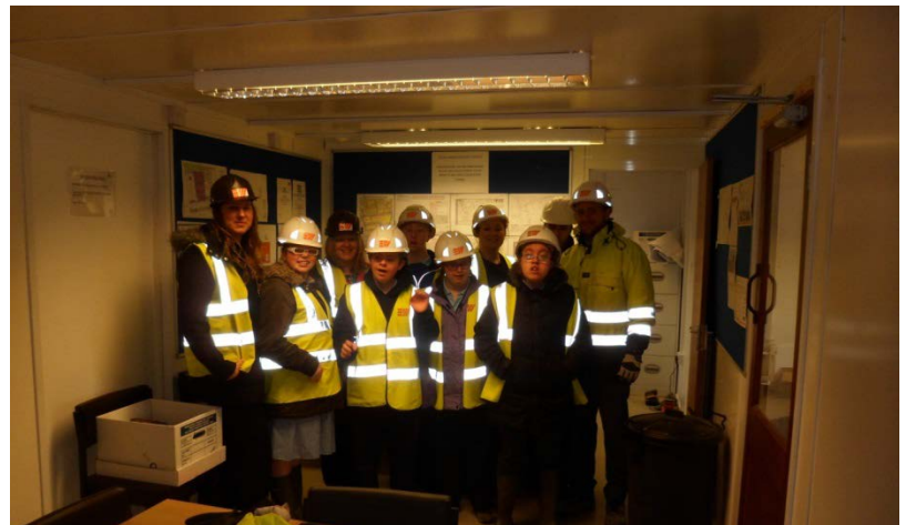
Local children visit the new Compass Centre

We appreciate your support during these activities and would like to thank those in the local community for their kind comments.